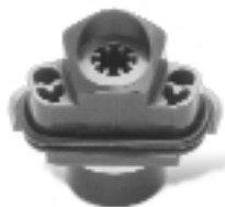
New Talon Dual-Spreader Nozzle

Performance data collected in zero wind conditions.